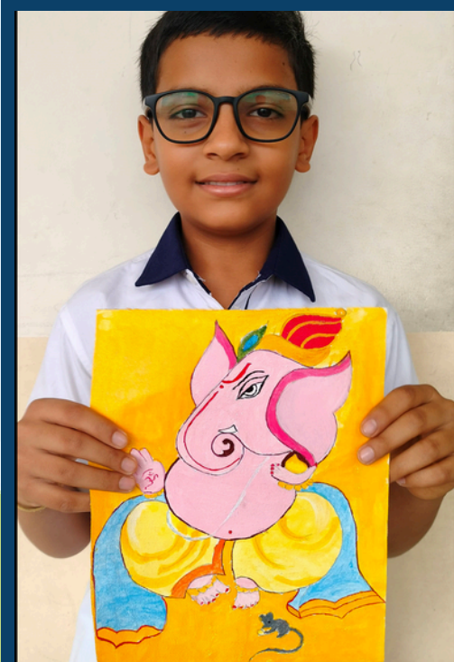
Shoumik Sandeep Grade 7