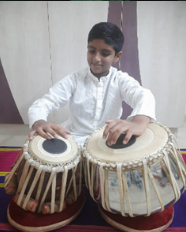
TABLA: THE ART OF RYTHM

The Tabla is more than just an instrument—it's the heartbeat of Indian classical music, with every beat telling a story. Comprising two distinct drums, the Tabla (right-hand drum) and the daga (left-hand drum), it creates a symphony of sounds, from sharp, crisp beats to deep, thunderous tones. Crafted from wood and metal or clay, the Tabla responds to the subtle movements of the hands, offering an incredible range of expression.